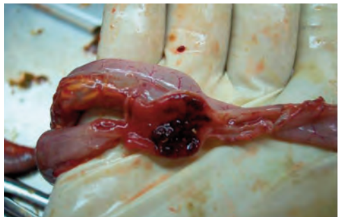
Velogenic viscerotropic strains of NDV target the gastro-intestinal tract, inducing massive destruction of intestinal lymphoid areas and extensive ulceration of overlying intestinal epithelium.

viruses or mycoplasma infections). These facts clearly state the necessity of vaccines that do not require artificial attenuation before use, suitable for mass inoculation and capable of inducing local and systemic immunity without severe respiratory vaccine reactions.