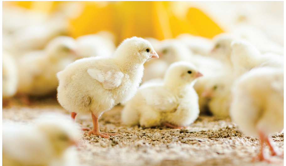
Biostrong Fertile supports efficiency in the production of day-old chicks.

Improving male fertility is the most efficient way to strengthen the production of day-old chicks.