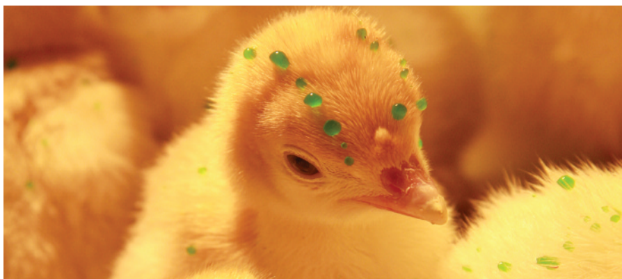
PoultryStar gel droplet hatchery application provides day-old chicks with a head start against multiple drug resistant enteric pathogens before leaving the hatchery.

For these reasons, international public health organisations and many governments