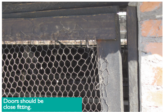
Doors should be close fitting.