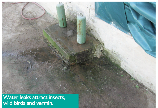
Water leaks attract insects, wild birds and vermin.