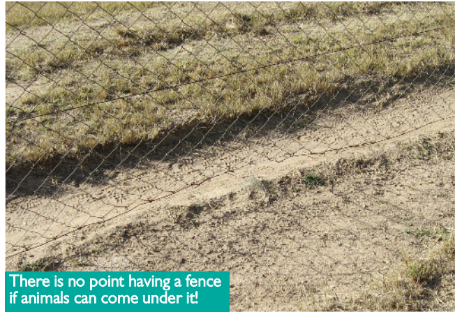
There is no point having a fence if animals can come under it!

When it comes to breeder farm or hatchery biosecurity there can be numerous weak links. In this photo feature we highlight some of the problem areas that may need attention.