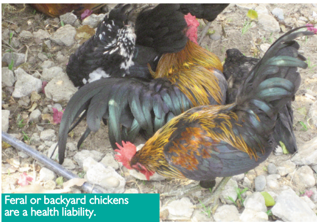
Feral or backyard chickens are a health liability.