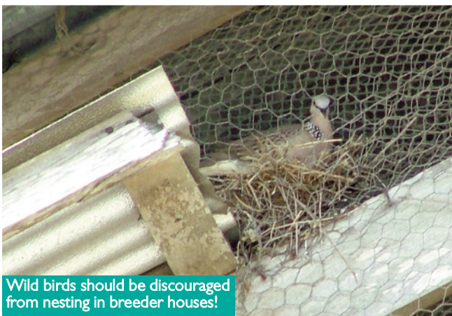
Wild birds should be discouraged from nesting in breeder houses!