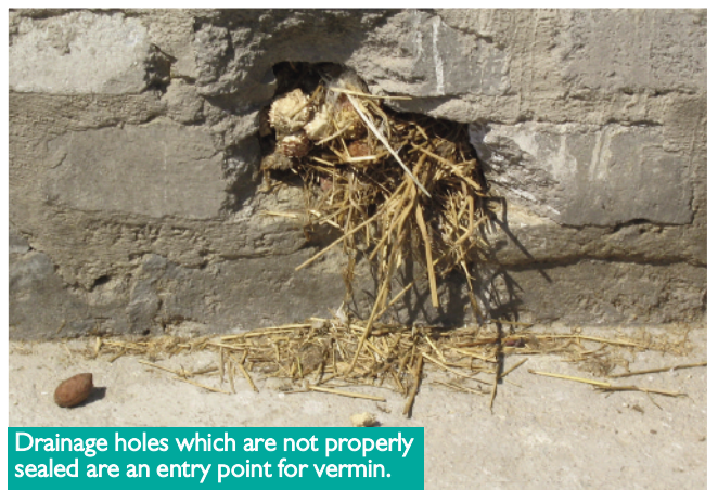
Drainage holes which are not properly sealed are an entry point for vermin.