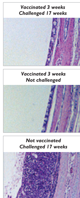
Fig. 2. Tracheal thickening after MG challenge. All birds had no measurable antibody at challenge (see Table 2). Note typical mycoplasma pathology in the bottom panel above.

We have now developed sophisticated strain identification methods using genomic tests to analyse field problems. These vaccines have allowed routine production of eggs and poultry meat in Australia and elsewhere without the need for regular antibiotic treatment. One drop of each vaccine in the eye provides immunity for the total productive life of the bird. ■