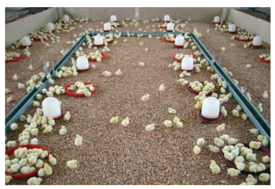
Evenly distributed feeding and drinking equipment, low stocking densities and cardboard surrounds to prevent draughts in an Egyptian grandparent stock farm.

The same applies for the lighting programme: the step-down programmes that the breeding companies recommend aim to encourage optimal growth (which often means achieving the upper side of the standard or even slightly above). They can, however, be adapted according to the actual