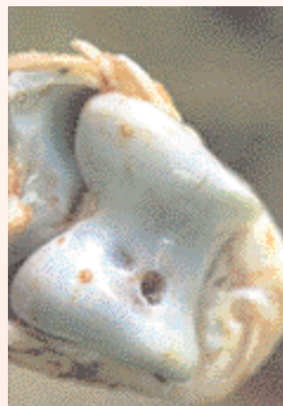
M. synoviae lesions in a leg joint.

It was significantly less frequent in single house farms than multi-house farms.