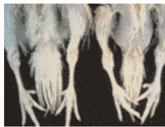
Leg changes due to mycoplasma.

appears to be a less overt pathogen, causing mainly sub clinical infections.