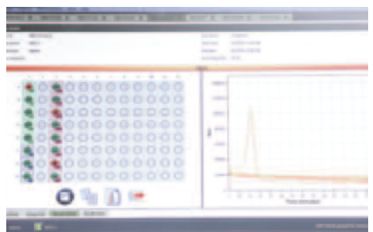
3M Molecular Detection Software.

The capped assay tubes each have a self contained reagent pellet to which is added the 20µL of lysate. The tubes are transferred into a speed loader tray and this is put into the instrument which then processes the tests. A positive result will usually be readable as early as 15 minutes, but the system runs for 75 minutes to confirm the negative results.