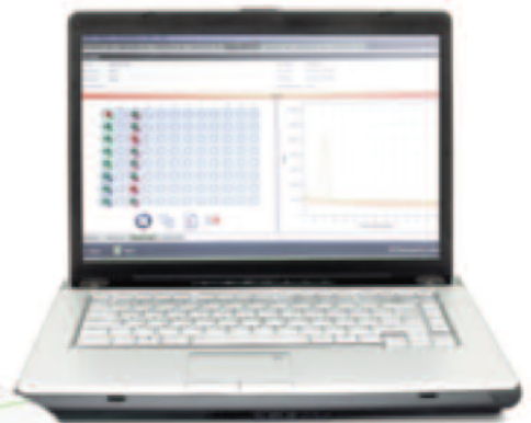
3M Molecular Detection System.

The program is then selected on the laptop either using a previously set test pattern or by creating settings tailored for a new