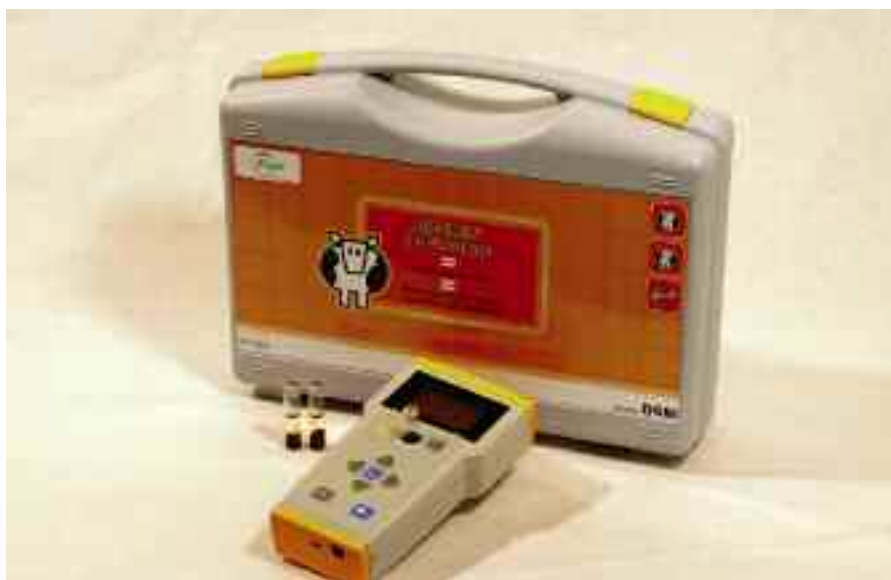
iCheck and iEx for rapid assessment of \beta -carotene status at cow side.

Continued from page 15 and analysed by the classical method of HPLC and compared with the novel assay system for \beta -carotene, using the iEx solvent extraction and iCheck spectrophotometer. \beta -carotene values ranged from deficient (0.32mg/L) to very high (15.30mg /L). No differences were observed between \beta -carotene levels measured in serum or in blood.